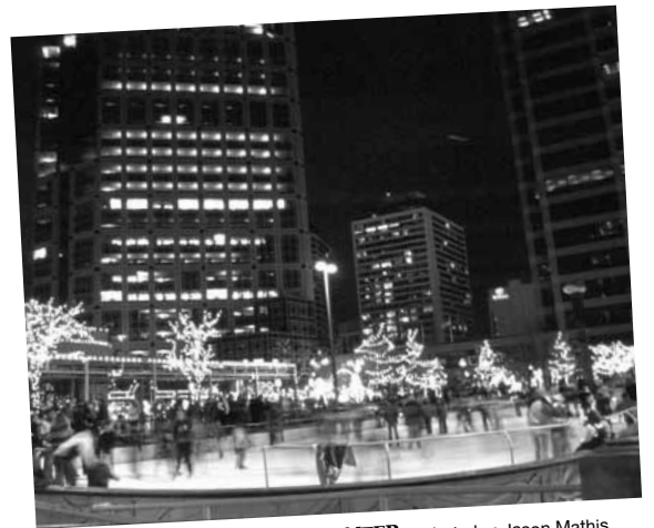
ICE SKATING AT GALLICAN CENTER