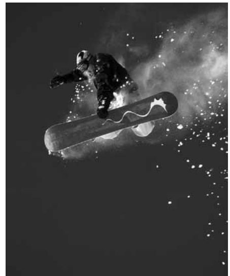
SNOW BOARDER KID, CHAIR LIFT, SNOW BOARDER IN AIR