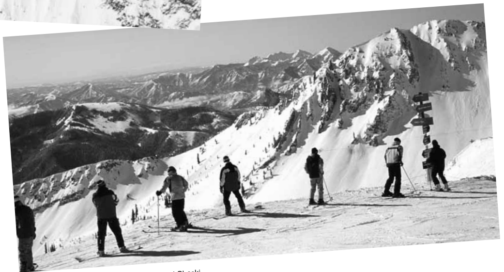
ALTA / SNOWBIRD ~ photo by: Richard Cheski